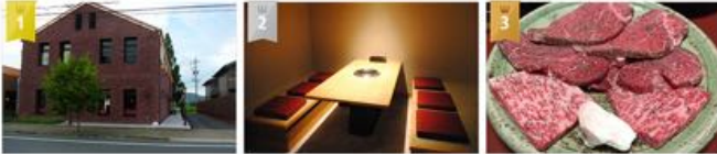
Charcoal fire grilled meat Moritsuji

Travelers' reviews and rankings posted on TripAdvisor (as of November 2015) Powered by TripAdvisor